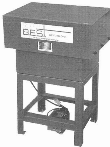
◀ MODEL VT-2424-VS-500 with optional stand and variable speed controller.

Air units are remotely variable by adjusting input pressure. One remote variable speed electric unit 115/1/60 power input is offered in the 18" square deck size only. Power input for all fixed speed electric units is offered in 115/1/60 as standard and 230/460V, 3p., 60c. as an option.